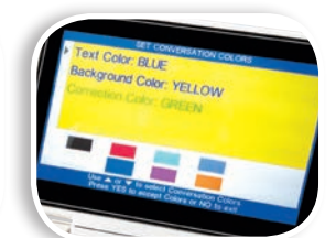
Adjustable Fonts / Colors Customize for easiest reading