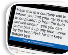
Large Color Display Screen Easy to read