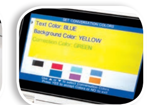
Adjustable Fonts / Colors Customize for easiest reading