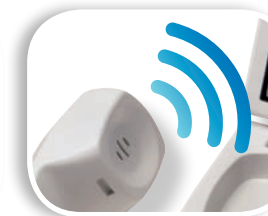
Amplifies Sound Up to 40dB gain captioned calls