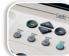
Speed Dial Buttons 1 touch dialing