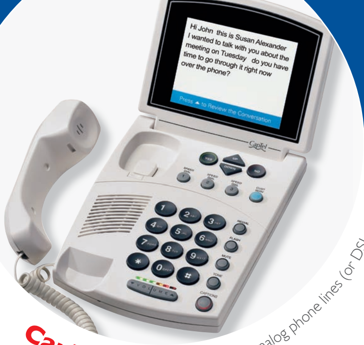
CapTel 800 – for use with analog phone lines (or DSL with filter)