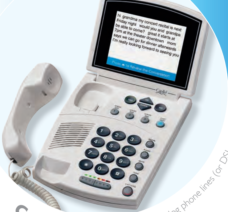
CapTel 800 – for use with analog phone lines (or DSL with filter)